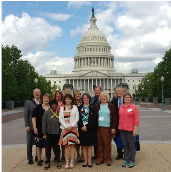
Wisconsin delegation to ALA's National Library Legislative Day, May 1-2, 2017