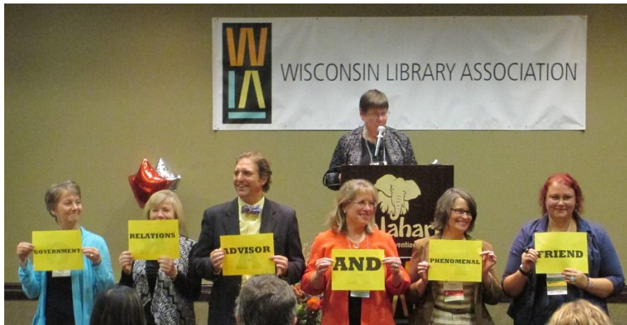
Members of the WLA Synchronized Acronym Team (WLASAT)