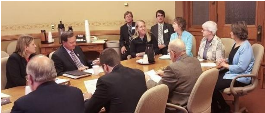
WLA members testify for AB572/SB491 at an Assembly committee hearing on November 16.