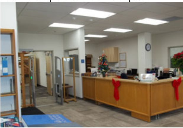
Front entrance and desk of FPL Library