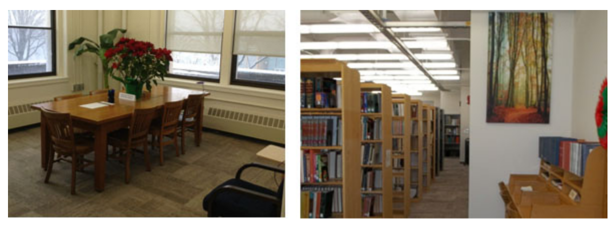
East side of FPL Library