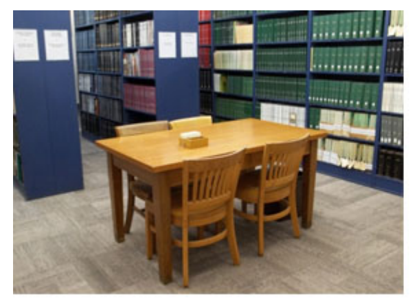
Library study area, west