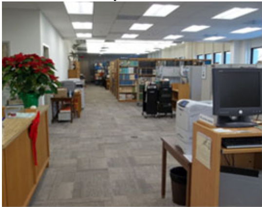
West side of FPL Library

our phone numbers and addresses have stayed the same. Only our room number has changed. Come and visit if you are in Madison, WI. Here are a few pictures of our new space.